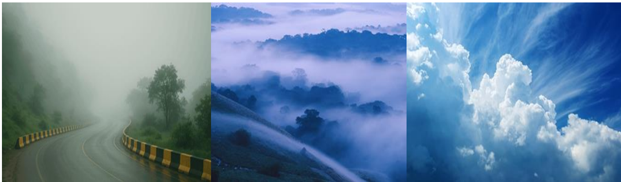
Figure 2: Fog, Mist & Cloud.

Persistence: Unlike radiation fog, which "burns off" quickly with sunlight, advection fog can be very persistent and cover massive areas.