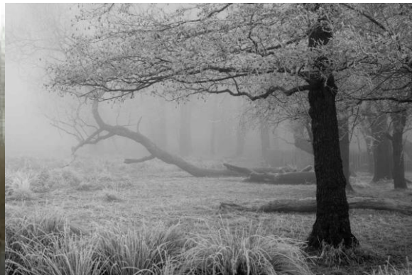
Figure-5: Precipitation Fog & Ice Fog.

Super cooled droplets: Water remains liquid in the air despite sub-zero temperatures.