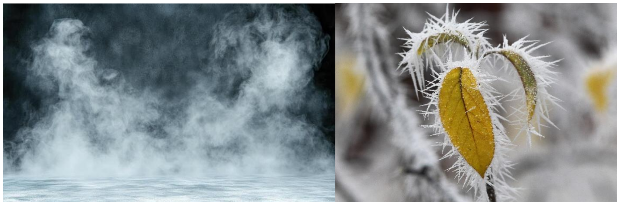
Figure 4: Steam Fog & Freezing Fog.

5. Steam Fog: Forms when cold air passes over warm, moist water, causing vapor to rise and condense. Appears when cold air passes over warmer water, looking like wisps of smoke rising off a lake. Steam fog—often called "sea smoke" or "arctic sea smoke"—is a type of fog that forms when cold, dry air moves over a relatively warm body of water. As the warm water evaporates into the colder air, the moisture quickly condenses, creating the appearance of wispy smoke or steam rising off the water's surface.