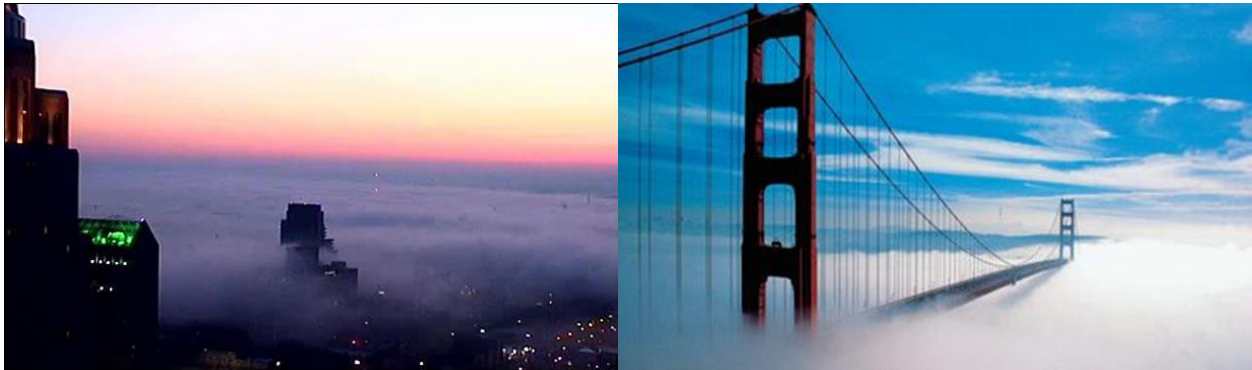
Figure 1: Radiation Fog & Advection Fog.

typically dissipates quickly as the sun rises. Radiation fog requires a very specific set of atmospheric conditions to develop. [1]