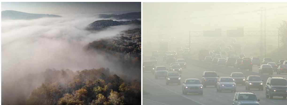
Figure 7: Mist & Smog.