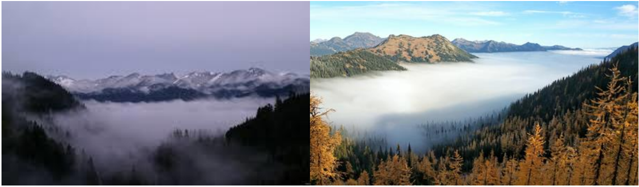
Figure 3: Valley Fog & Upslope Fog.

Density: Often much thicker and deeper than fog found on flat terrain.