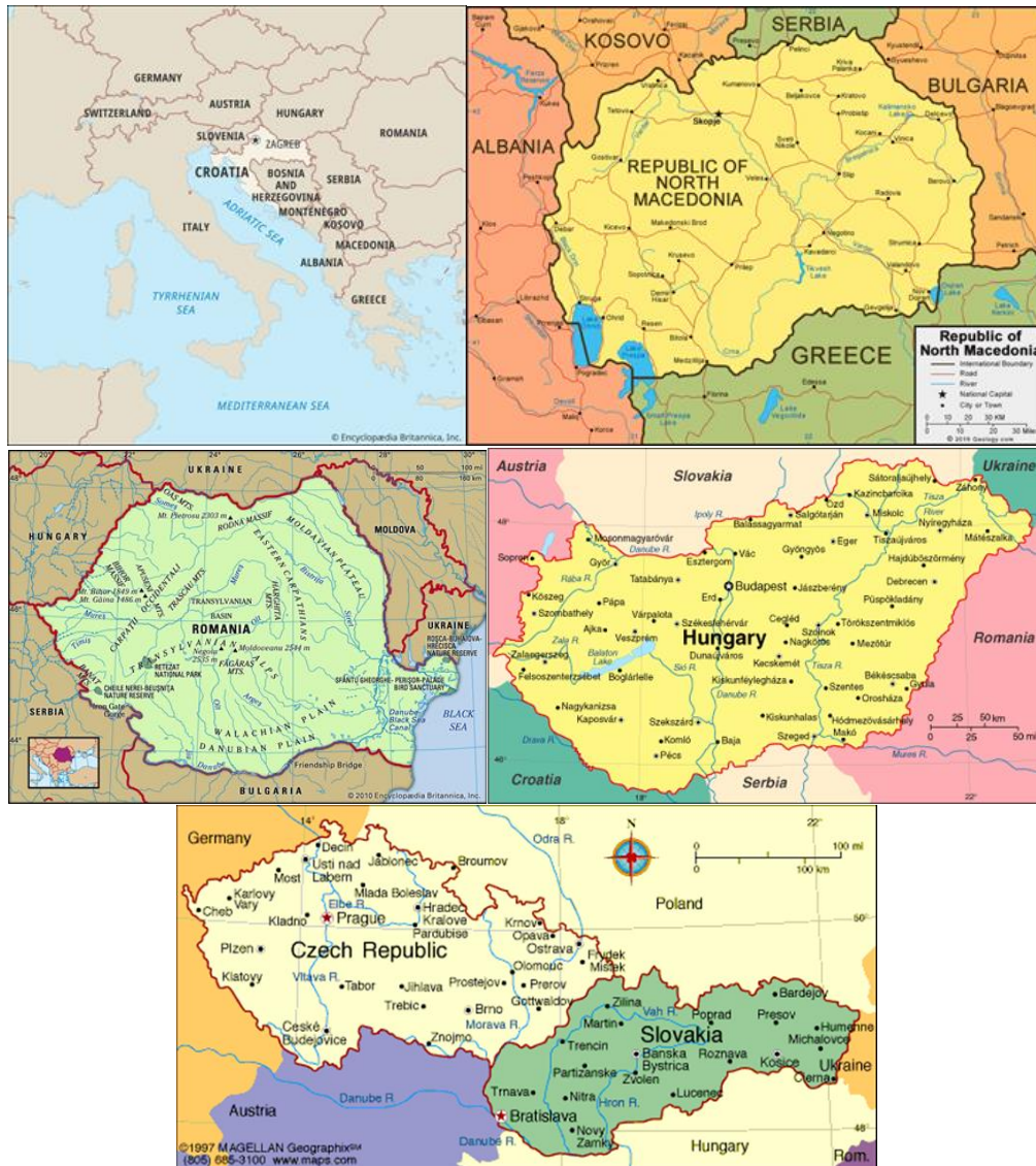
Figure-2: Moye Moye origin.

Serbian singer-songwriter Teya Dora is what everyone on social media is talking about. Actually, it's nothing- from the meaning to its original spelling, 'Moye Moye' has no meaning but is rather about how it's pronounced. The name comes from how it sounded to the desis. Hence, the 'Moye Moye' name.