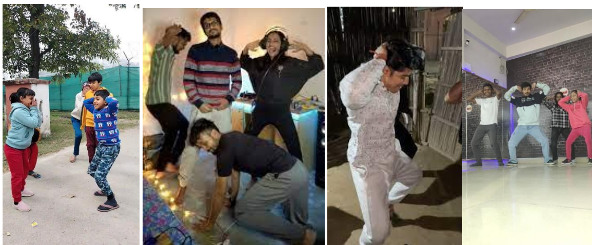
Figure-3: Dance reels Moyo Moyo.